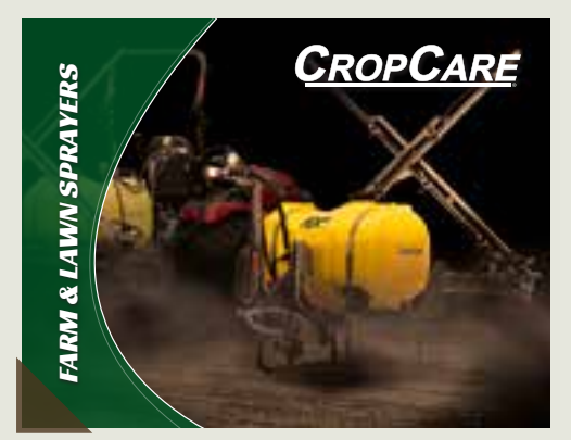
Farm & Lawn Sprayers Catalog

Picking Assistant Plastic Mulch Lifter-Wrapper Shielded Boom Sprayer