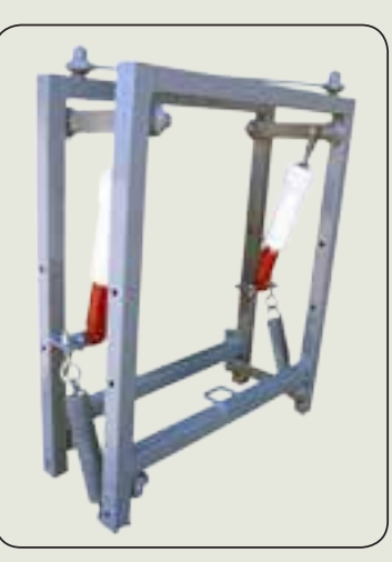
Boom folding and breakaway mechanism on 30' model

Optional boom suspension system (30' boom) helps booms ride smoother, increases application accuracy, and reduces stress on booms