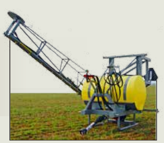
High pressure 3PT sprayer

20' or 30' manual fold boom Height adjustments up to 48" of clearance