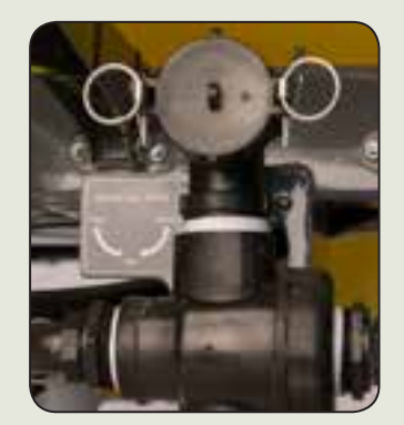
2" quick-fill adapter

· Visible and easy to follow large foam drops reduce overlapping and skipped areas