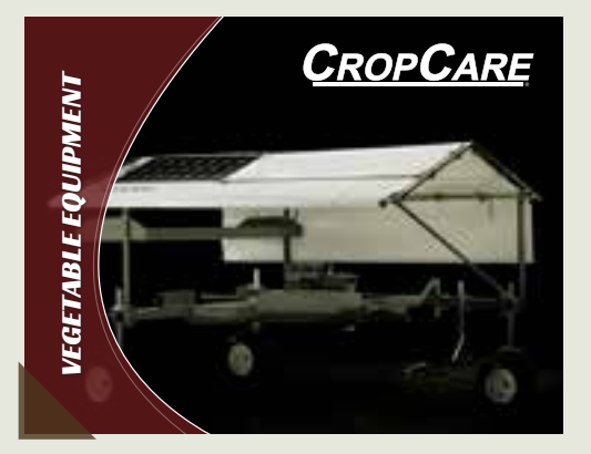
Vegetable Equipment Catalog

Picking Assistant Plastic Mulch Lifter-Wrapper Shielded Boom Sprayer