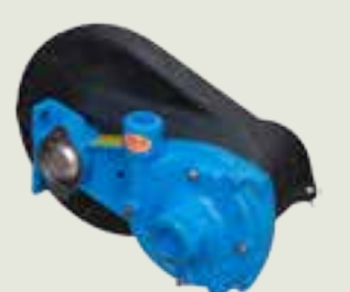
Belt drive centrifugal pump

CropCare<sup>®</sup> sprayers are offered with a variety of pump selections to best utilize your tractor's capabilities and enable you to achieve the performance required for your various application needs.