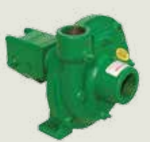
Hydraulic drive centrifugal pump