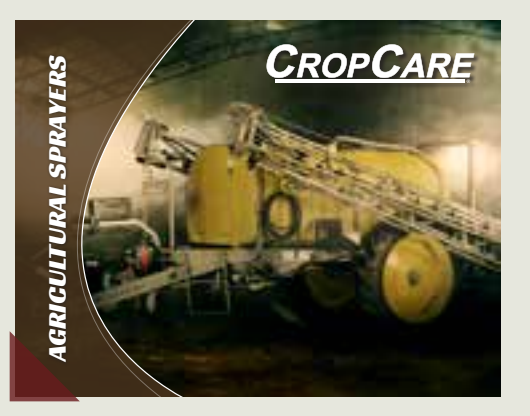
Agricultural Sprayers Catalog

Trailer Sprayers: 200, 300, 400, 500, 750, 1000 Gal 3PT Sprayers: 110, 150, 200, 300, 400 Gal High Pressure Produce Sprayers Shielded Boom Sprayer Options & Accessories Sprayer Booms