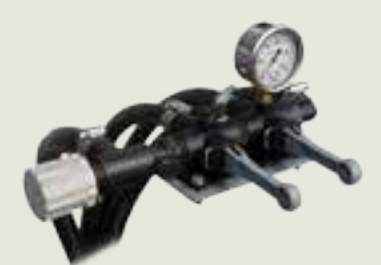
6B manual control

• Spray herbicides across a wide pressure range (15-90 psi)