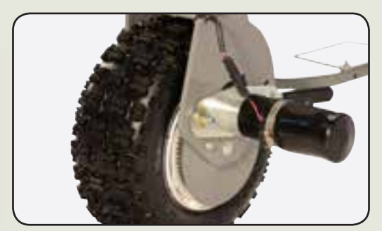
Motor locks to wheel