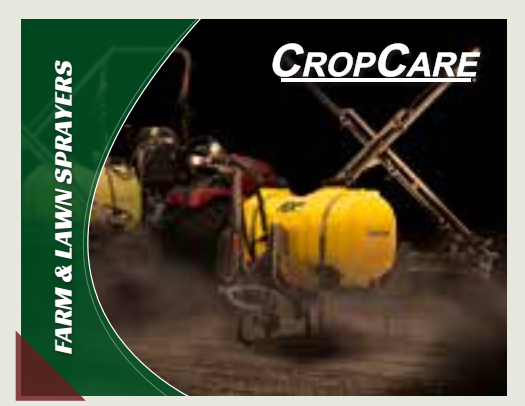
Farm & Lawn Sprayers Catalog

Trailer Sprayers: 200, 300, 400, 500, 750, 1000 Gal 3PT Sprayers: 110, 150, 200, 300, 400 Gal High Pressure Produce Sprayers Shielded Boom Sprayer Options & Accessories Sprayer Booms