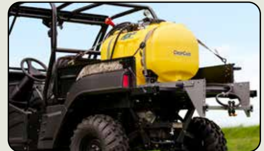
ATX-60 with ATX-SK configuration mounted on a utility vehicle