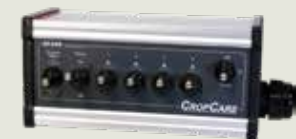
CropCare® SC400 electric control