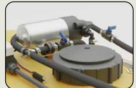
Valve for adjusting pressure

Prices shown are not inclusive of setup and shipping costs.