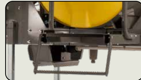
Side step and operator platform