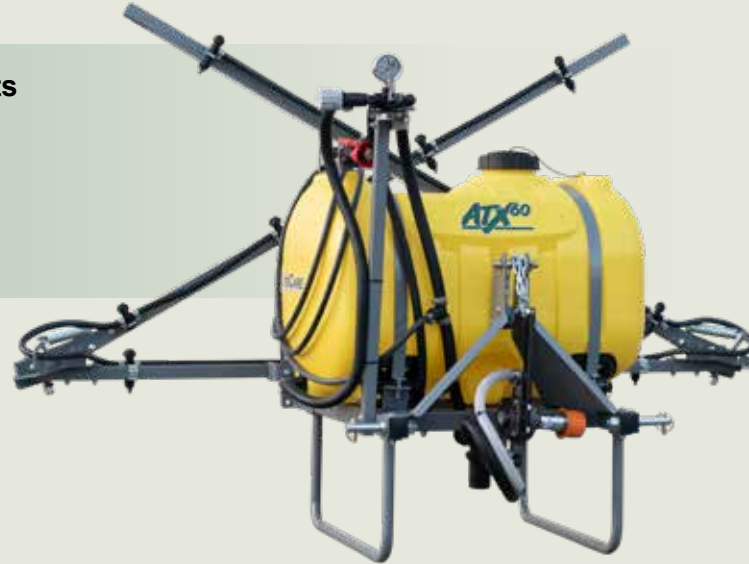
60 Gal 3PT Sprayer