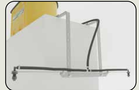
Boom with 90" spray pattern