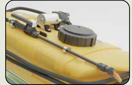
TeeJet® Spray Gun