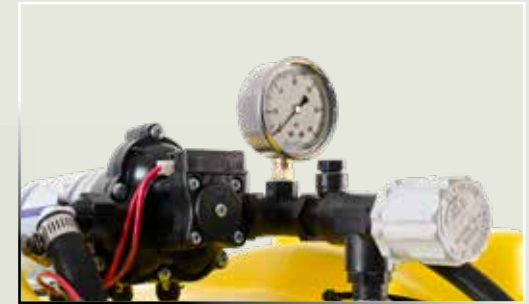
Pump with regulator and gauge

2.5 gal CropCare® turf marker system reduces overlapping or missed areas and is perfect for use on lawns, turf, or pasture.