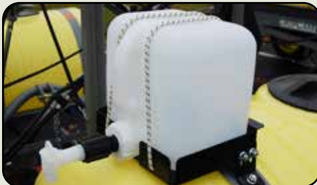
Fresh water safety tank