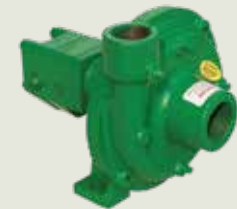
Hydraulic drive centrifugal pump