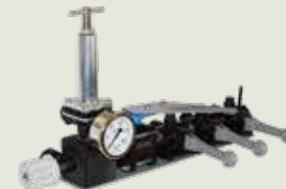
TeeJet® 6B manual control