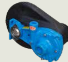
Belt drive centrifugal pump