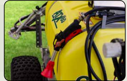
Heavy-duty pistol grip spray gun