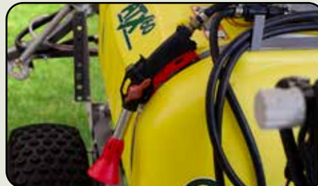
Heavy-duty spray gun with 50' hose