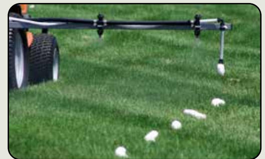
CropCare® turf marker system