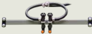
20' boomless nozzles