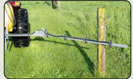
Boom breakaway protection - boom snaps back unharmed