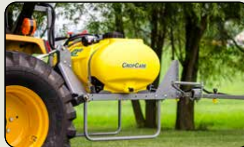
ATX with ATX-3PT configuration mounted on a compact tractor