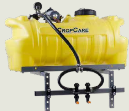
ATV sprayer with 20' boomless nozzles