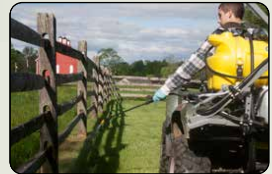
Operator using spray handgun