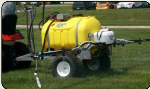
ATX-60 with ATX-TR configuration towed behind a tractor

Fits nicely in the bed of your all-terrain utility vehicle