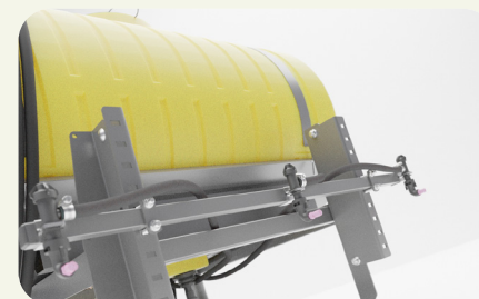
30' Boomless Spray Bar