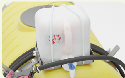
Safety Rinse Tank