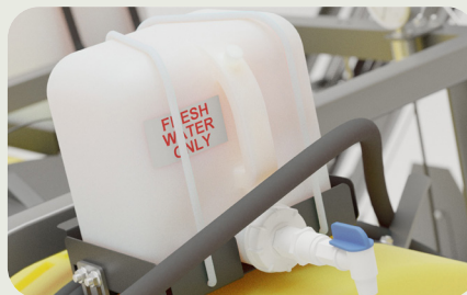
Safety Rinse Tank